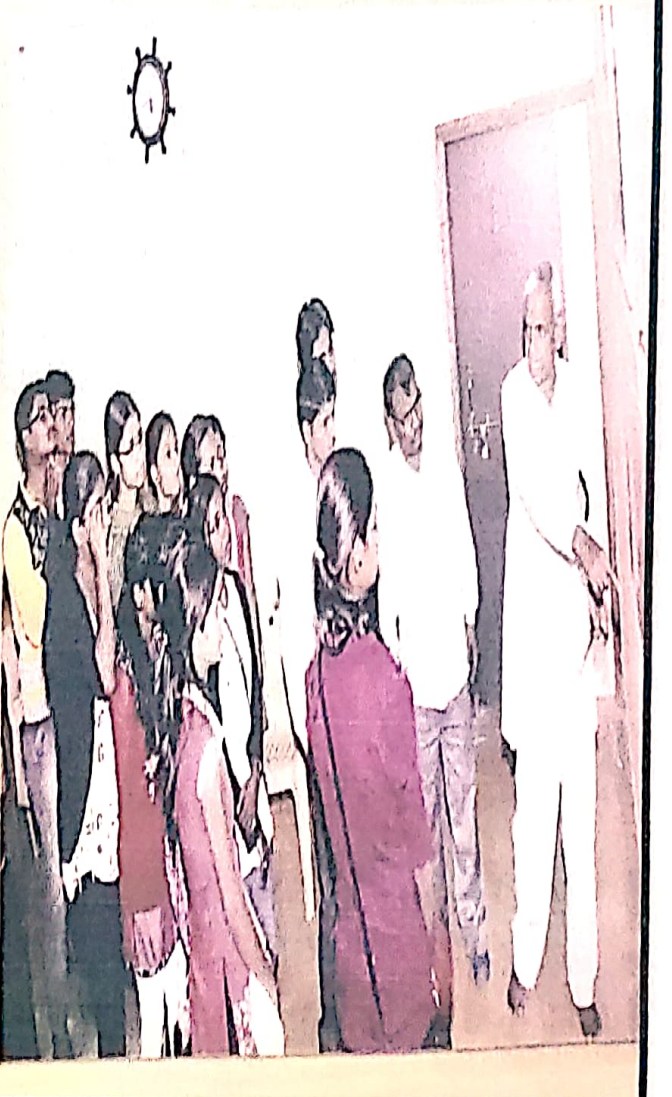
visit to Adarsha Gram Hivare Bazar, Ahmednagar.

[Signature] PRINCIPAL Nutan Mahavidyalaya